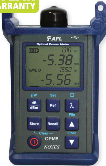
OPM5 Optical Power Meter